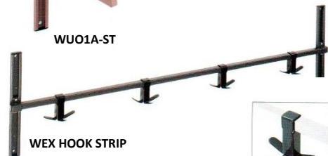
WEX HOOK STRIP