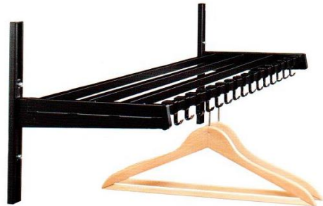
WUO1A-ST W/SR34 & MG17B